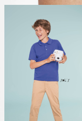
SUMMER II KIDS 11344