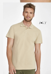
SUMMER II 11342